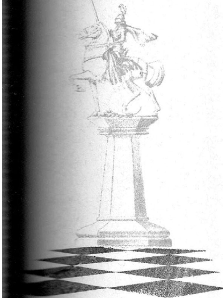
Cover image from June 1959 Washington Chess Letter.