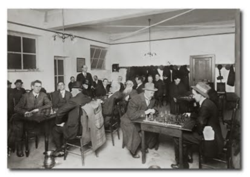
Portland Chess and Checker Club 1914 – Circle Theater